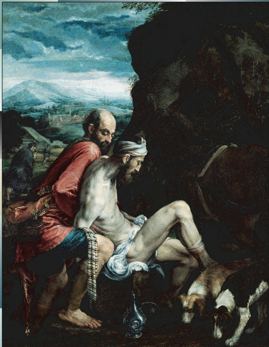
The Good Samaritan Jacopo Bassano